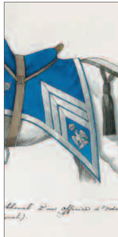
For comparison, a detail of Plate 115 (above).