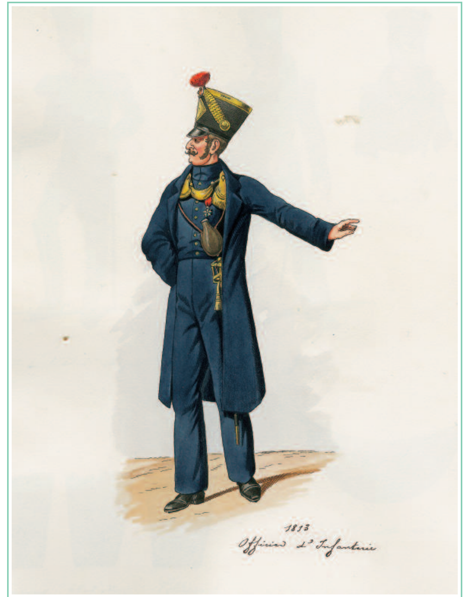
34-1813 Officier d'infanterie